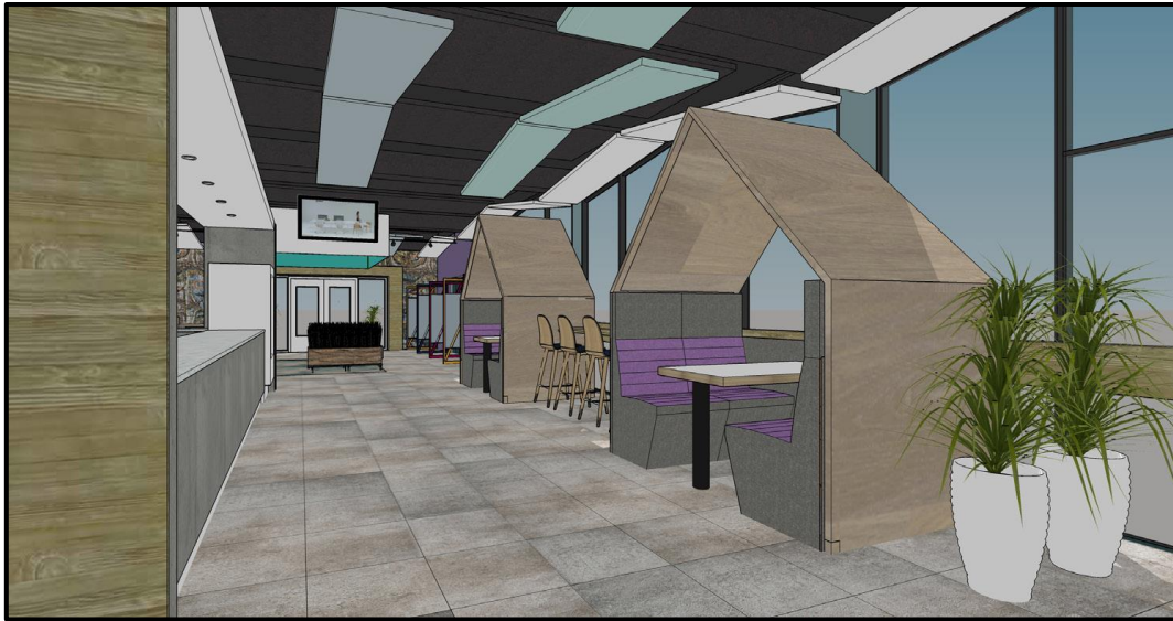
Space Strategies: Vision for the Arcade

suggestions and highlight concerns, and a walk through the site. Further engagement was carried out with potential furniture suppliers, including two supported businesses.