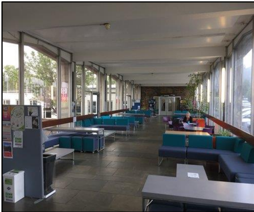
The Arcade before refurbishment

The Arcade area at the Peter Wilson Building, Edinburgh Campus was identified as a key area requiring a re-imagining of use and general refurbishment. Traditionally the Arcade was a general space for students to gather during the day and had also seen occasional use for staff gatherings, exhibition of student work, informal meetings, and other events. However, it was not considered to offer the comfort or facilities which would encourage students to stay on site between classes, nor was it a fully utilised hub for staff collaboration.