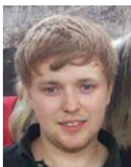
✓ Image acceptable