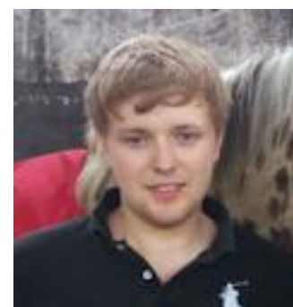
✗ Wrong dimensions