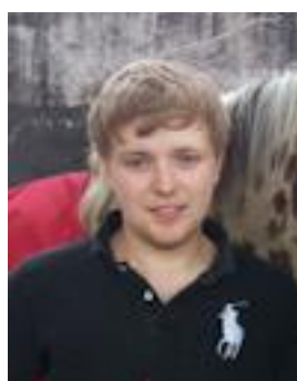
✗ Face too small within image